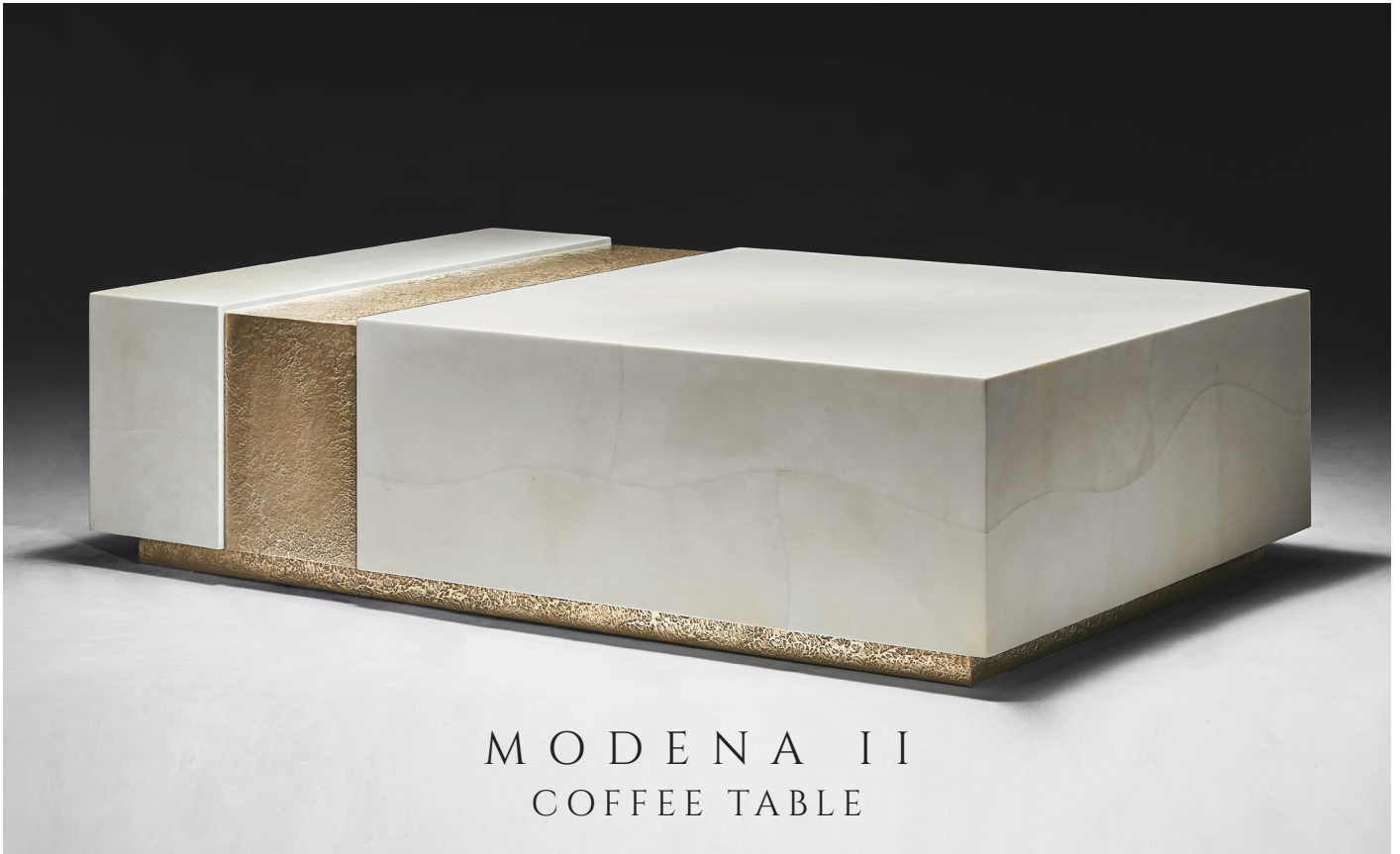
MODENA II COFFEE TABLE